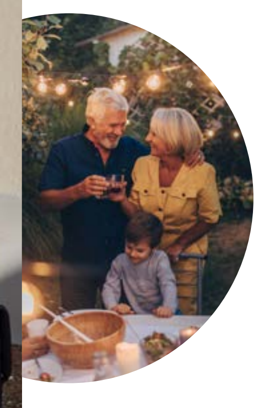
Illustration is for financial professional educational purposes only and assumes a borrower aged 62 who resides in Tennessee and an adjustable interest rate, with an initial rate of 7% (+0.50% MIP), and financed fees of approximately 3.4% of the home value. Rate quote generated on 5/22/2023. Rates are rounded to the nearest 0.125% and are subject to change

Home Value: $600,000 Paid Off Mortgage Balance: $0 Potential Line of Credit: $202,000